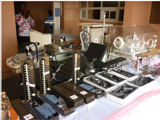
Some of the granted medical equipment

The commissioning ceremony was held on 30th June, 2016 at Bwari General Hospital in Bwari Area Council in the Federal Capital Territory.