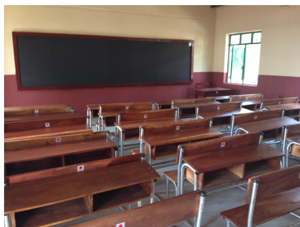
One of the classrooms

For more information: http://www.ng.emb-japan.go.jp/j/photo_gallery/20160727%20oyo%20primary%20school.pdf