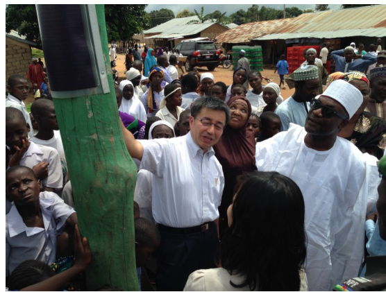
Standing by one of the newly installed solar street light

For more information: http://www.ng.emb-japan.go.jp/j/photo_gallery/20160621NigerSolarLights(English).pdf