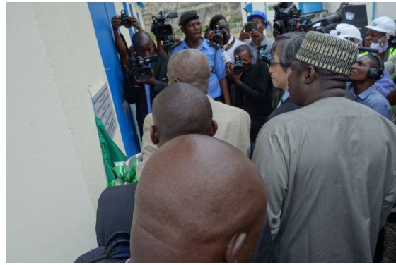
Official unveiling of Commemorative Plaque

For more information: http://www.ng.emb-japan.go.jp/Document/20160830%20USMANDAM.pdf