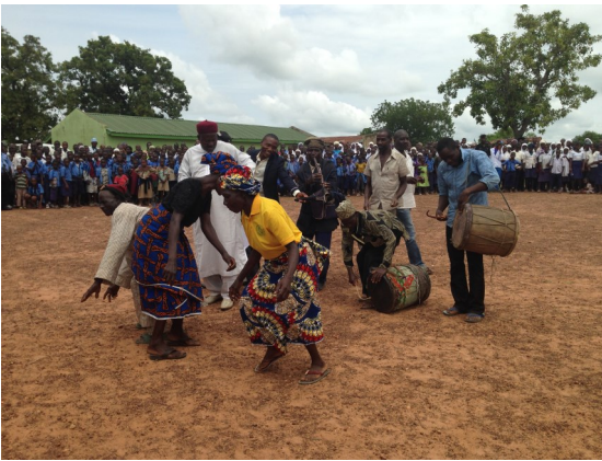
Cultural dance by the people of Kabo

The commissioning ceremony was held on 21st June, 2016 at Gurara Local Government Area in Niger state.